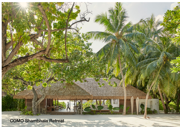
COMO Shambhala Retreat