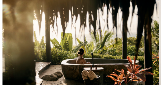
COMO SHAMBHALA LAUCALA ISLAND