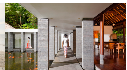
COMO SHAMBHALA UMA UBUD