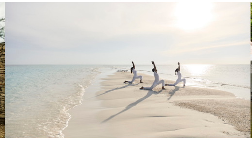
COMO SHAMBHALA COCOA ISLAND