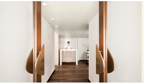
COMO SHAMBHALA METROPOLITAN LONDON