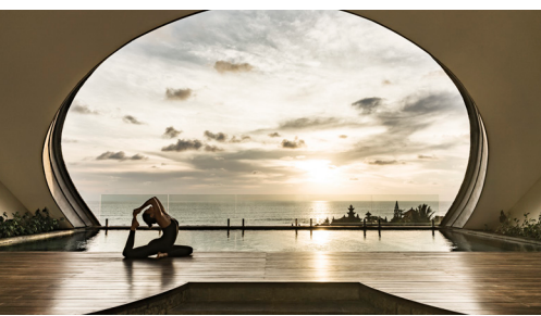
COMO SHAMBHALA UMA CANGGU