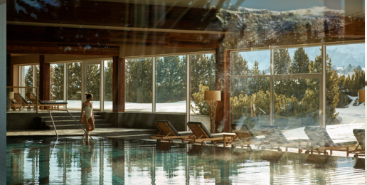
COMO SHAMBHALA ALPINA DOLOMITES