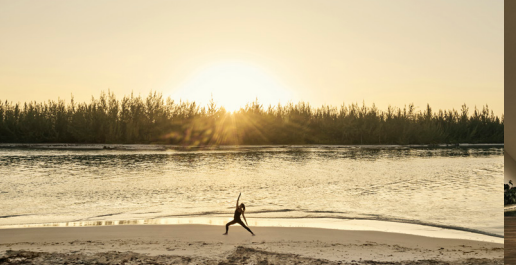
COMO SHAMBHALA PARROT CAY