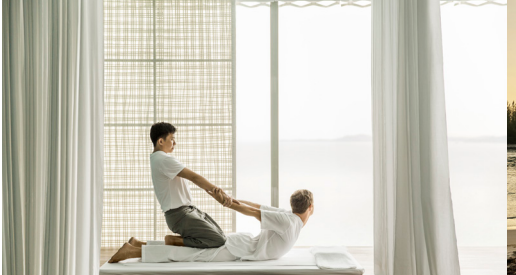
SHAMBHALA POINT YAMU