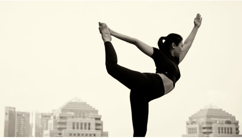
COMO SHAMBHALA SINGAPORE