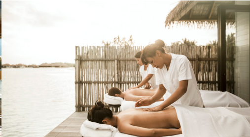
COMO SHAMBHALA MAALIFUSHI