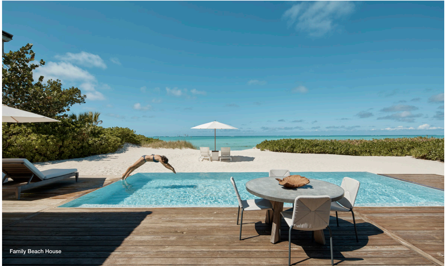
Family Beach House