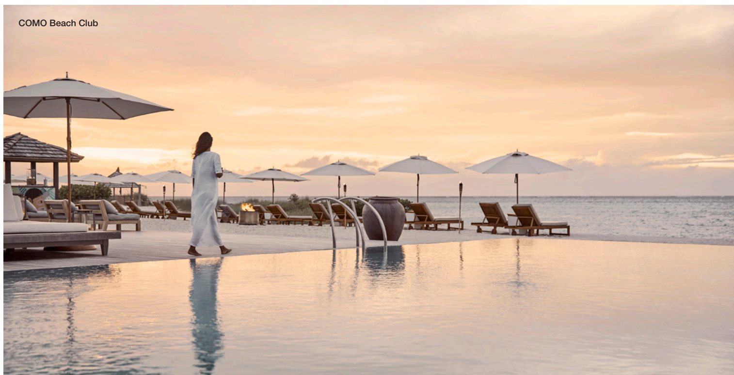
COMO Beach Club

Terrace Bar offers fresh juices, fine wines and exotic cocktails.