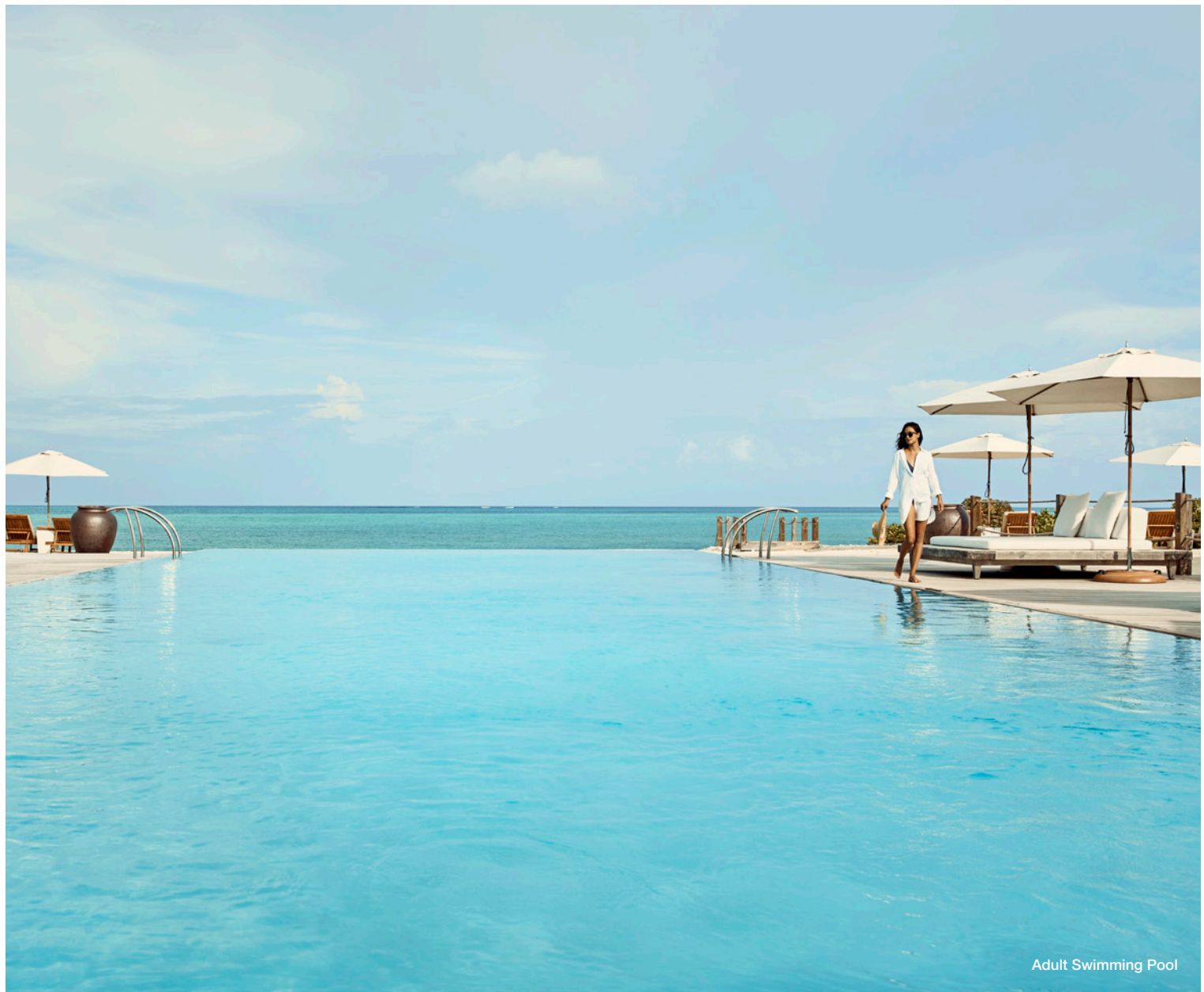
Adult Swimming Pool