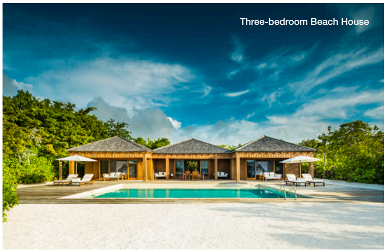
Three-bedroom Beach House