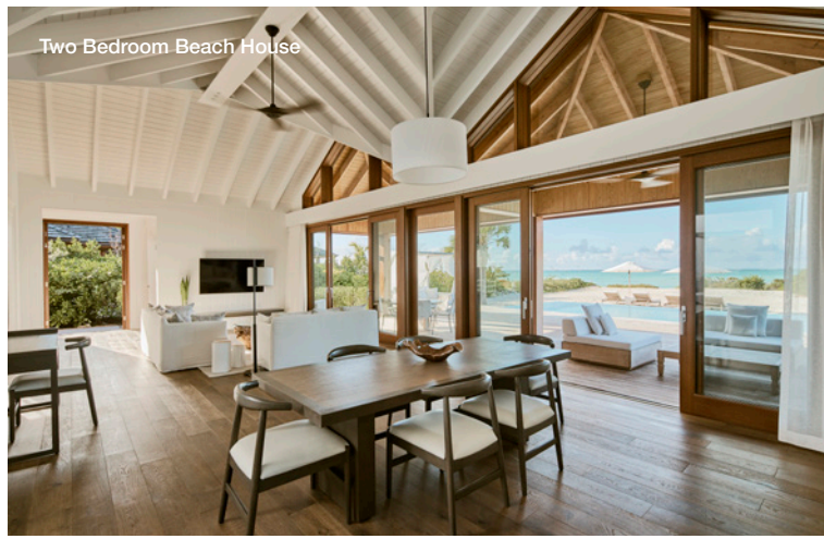
Two Bedroom Beach House