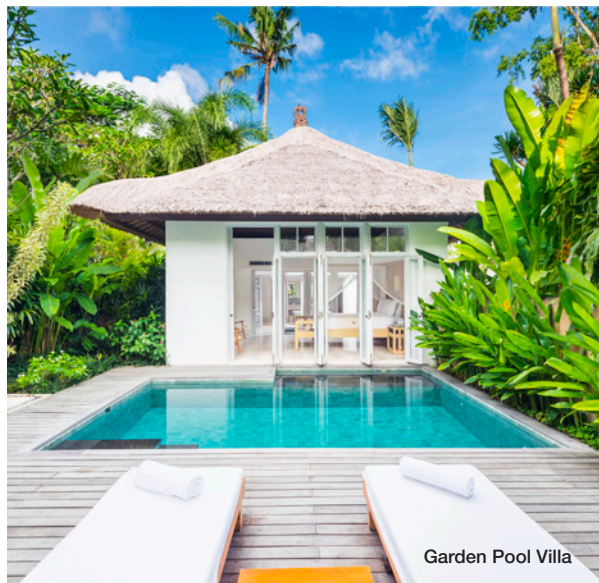
Garden Pool Villa