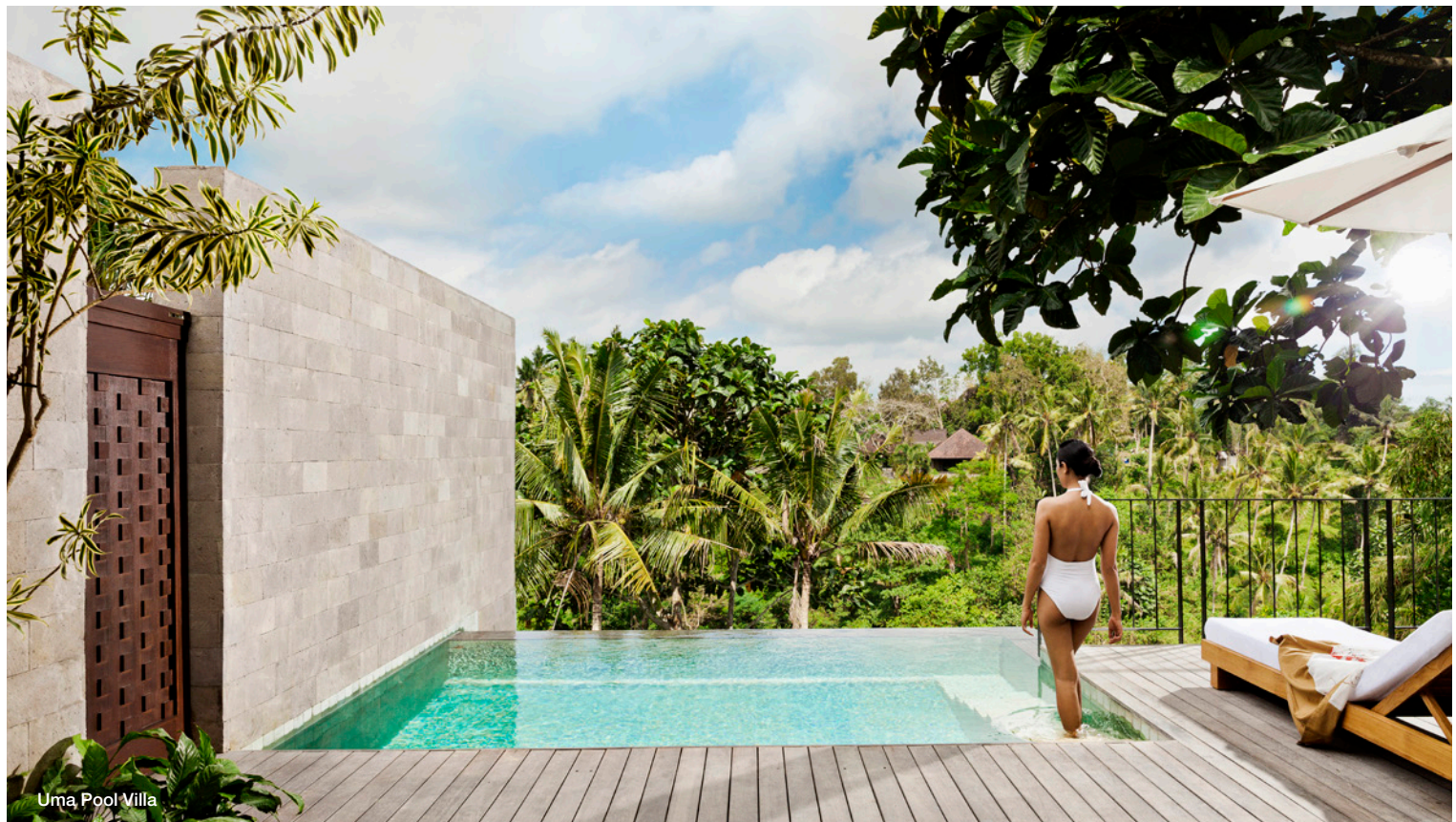
Uma Pool Villa