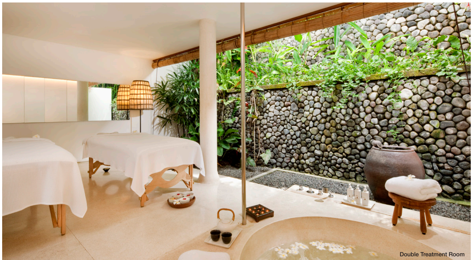
Double Treatment Room