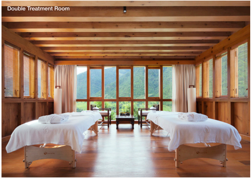
Double Treatment Room