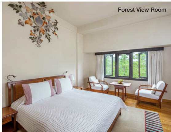
Forest View Room