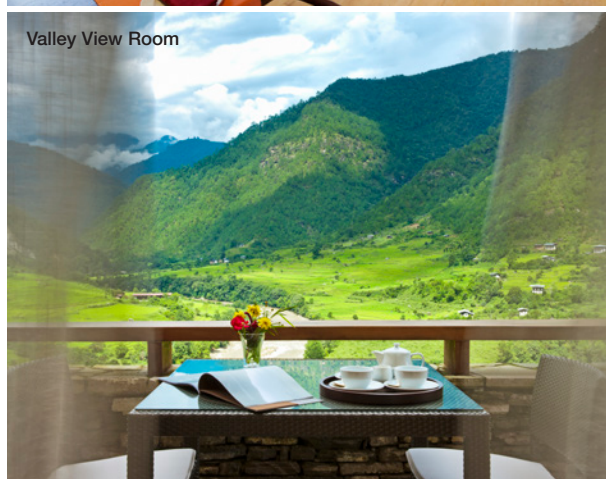
Valley View Room