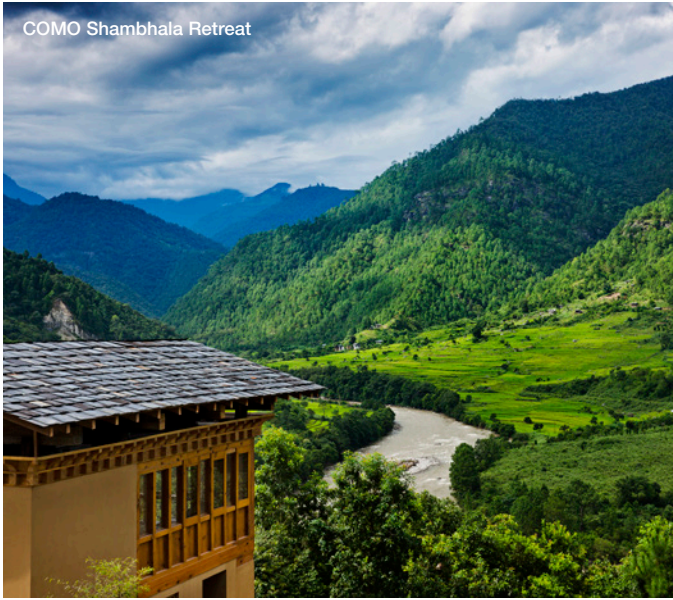
COMO Shambhala Retreat