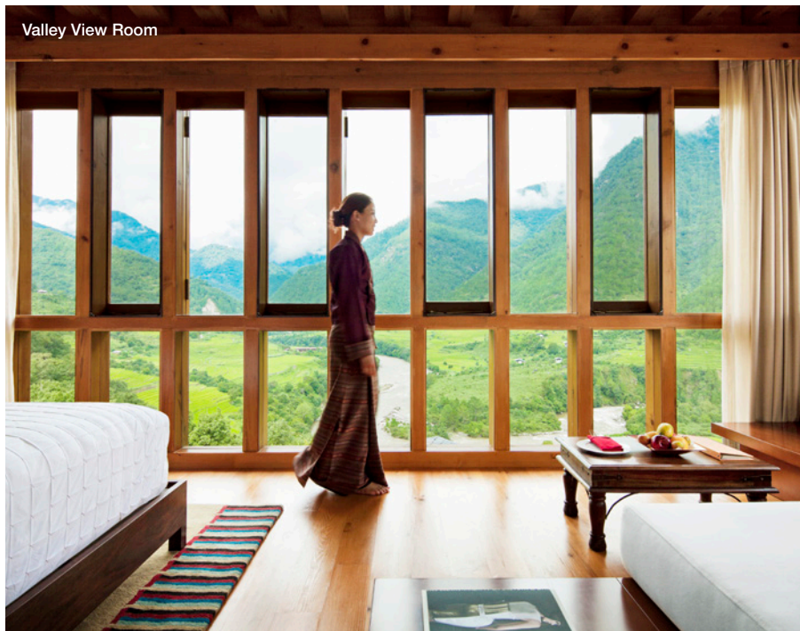
Valley View Room