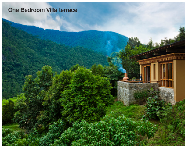
One Bedroom Villa terrace