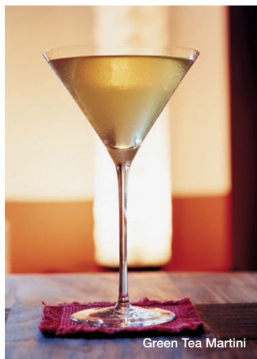
Green Tea Martini