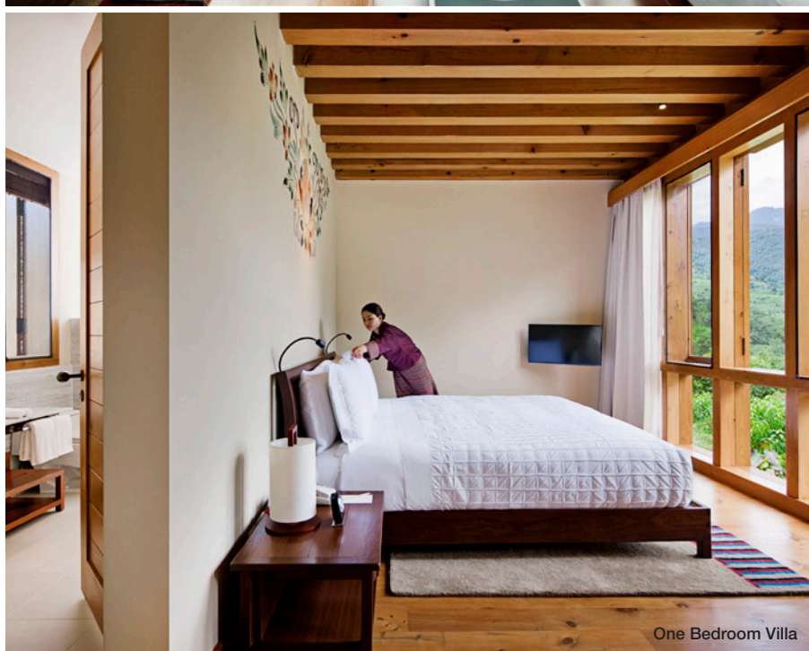
One Bedroom Villa