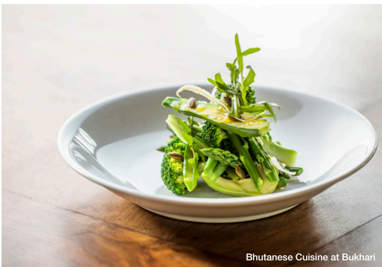
Bhutanese Cuisine at Bukhari