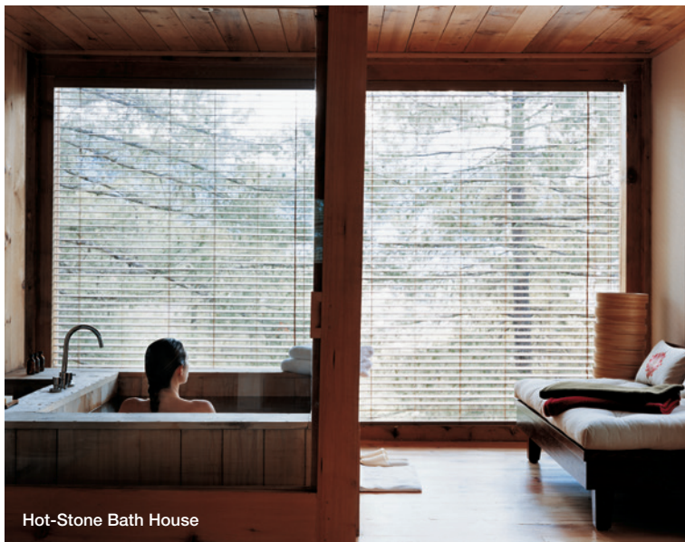
Hot-Stone Bath House