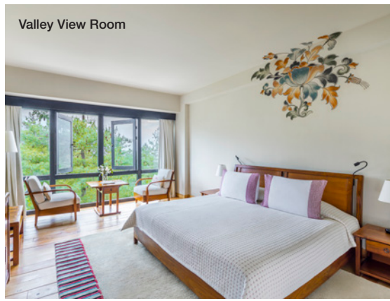
Valley View Room