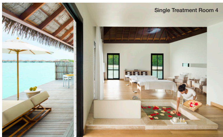
Single Treatment Room 4