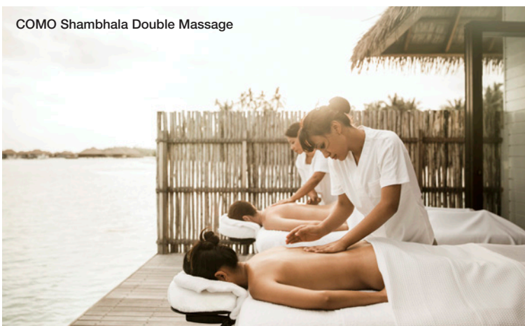
COMO Shambhala Double Massage