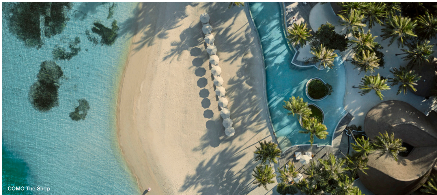
COMO The Shop