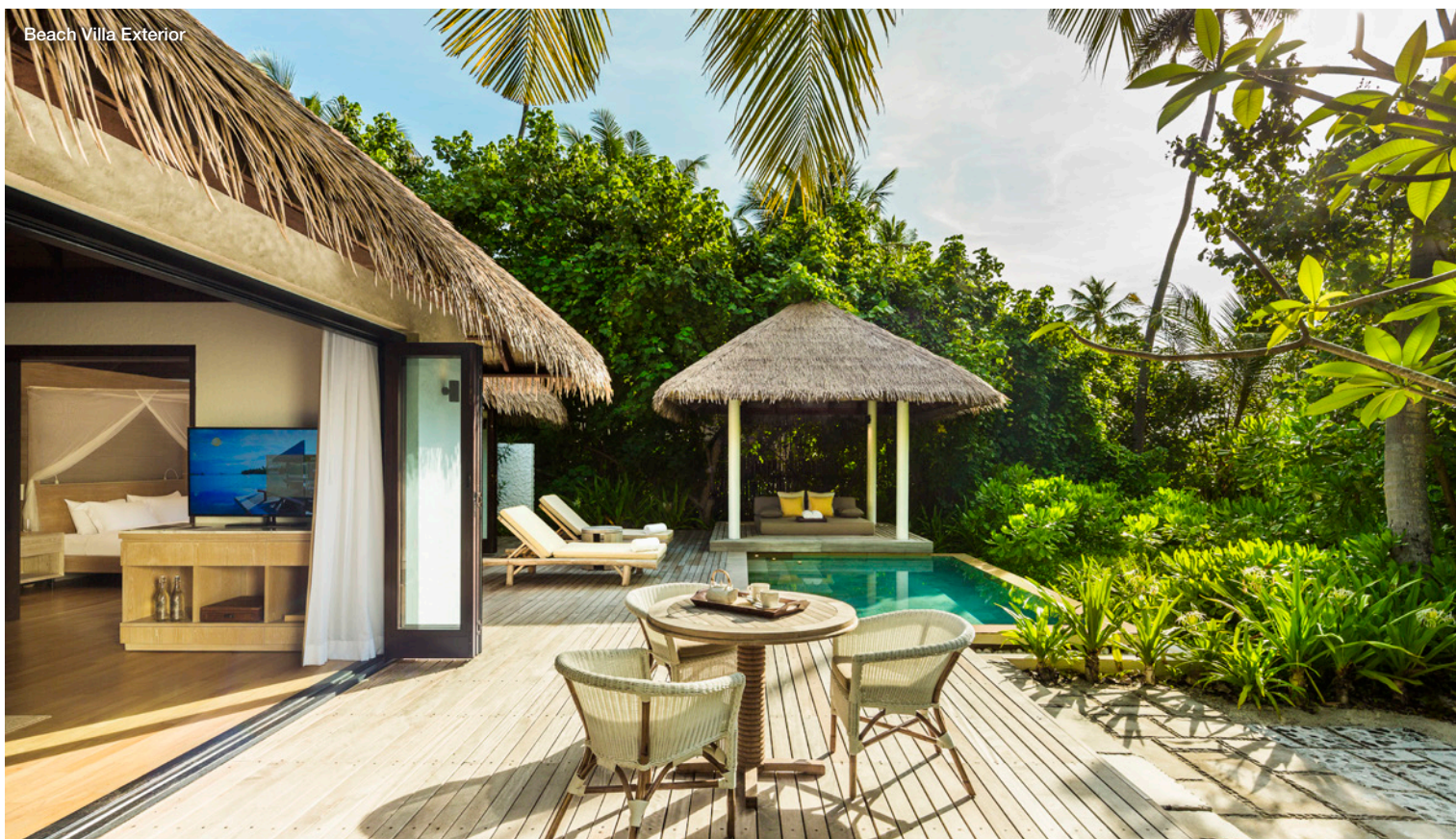
Beach Villa Exterior