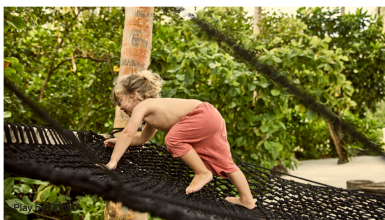
Play by COMO