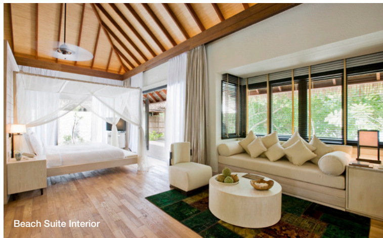
Beach Suite Interior