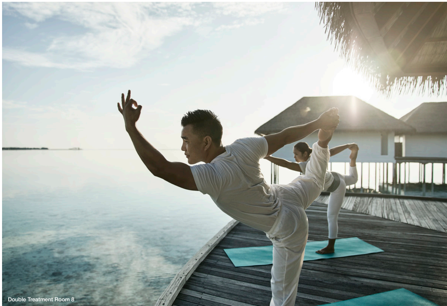
Double Treatment Room 8