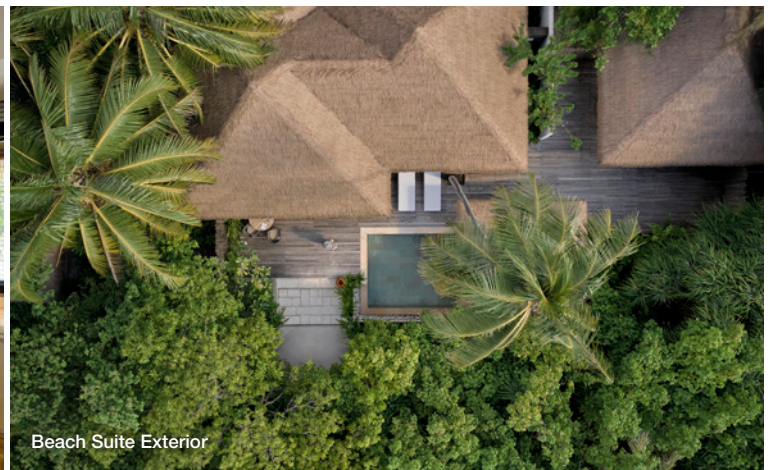
Beach Suite Exterior