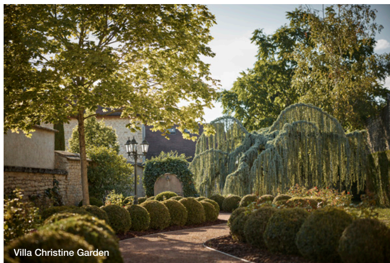
Villa Christine Garden