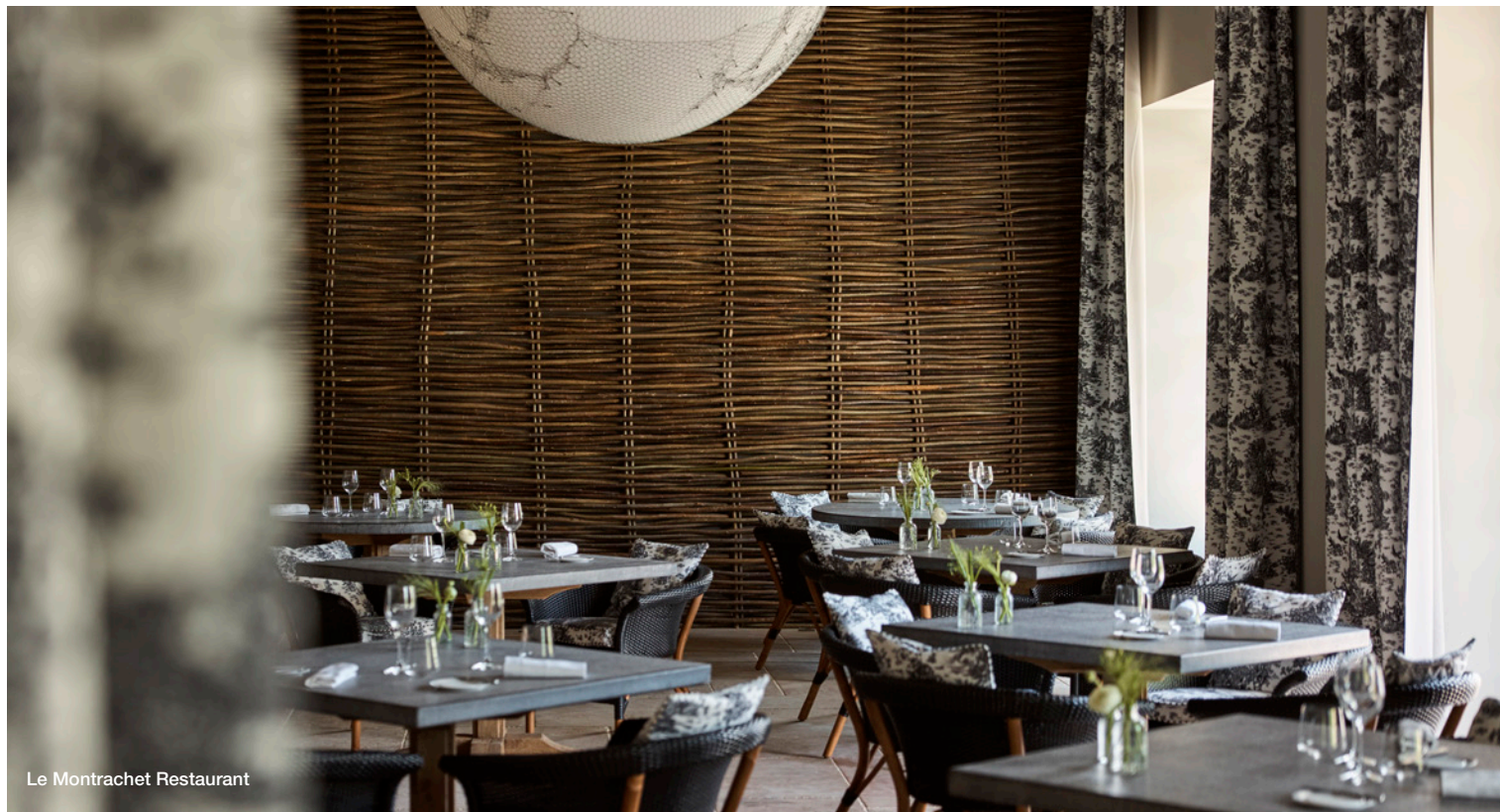
Le Montrachet Restaurant