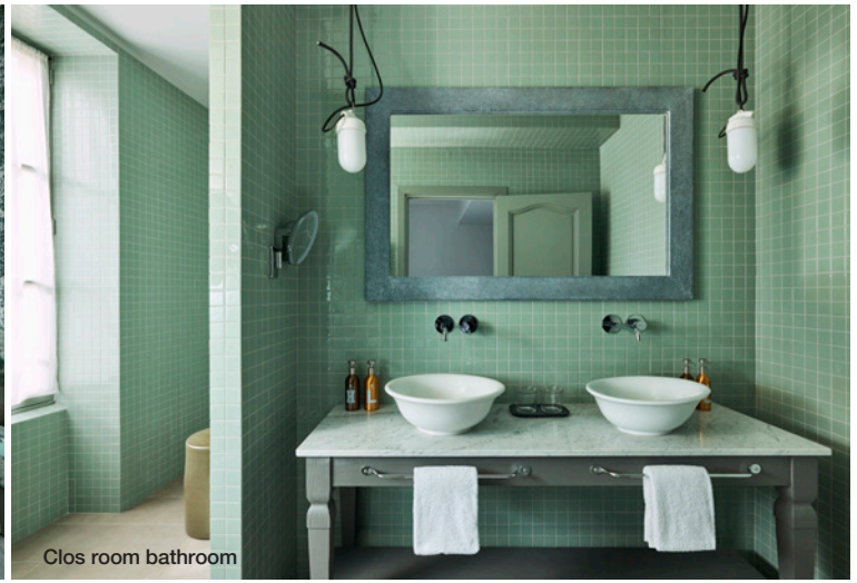
Clos room bathroom