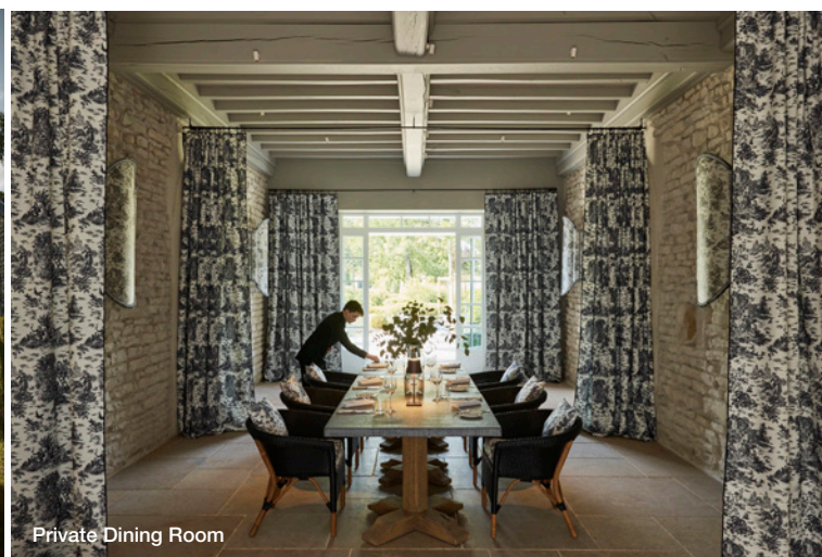
Private Dining Room