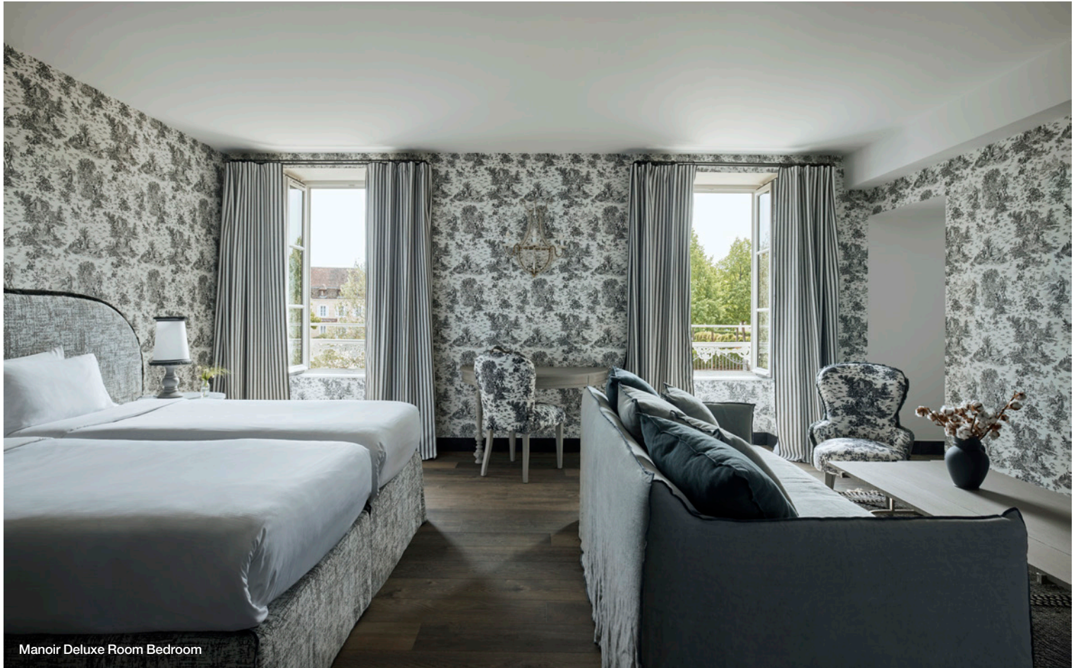
Manoir Deluxe Room Bedroom