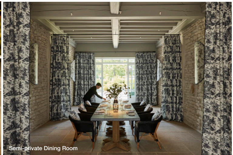
Semi-private Dining Room