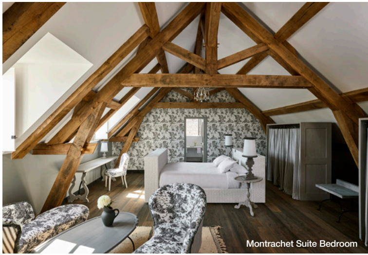
Montrachet Suite Bedroom