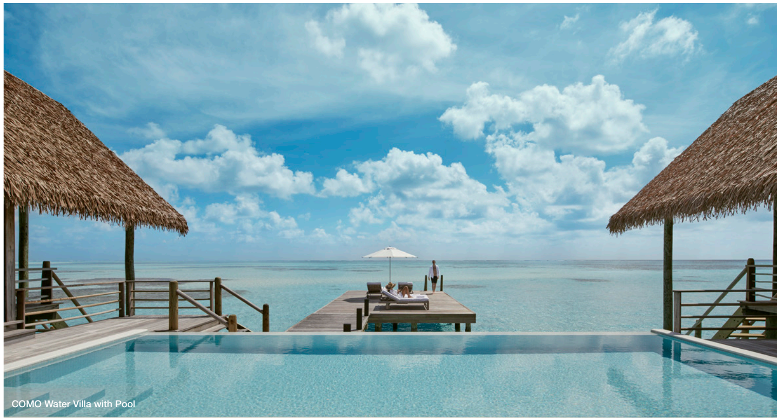
COMO Water Villa with Pool