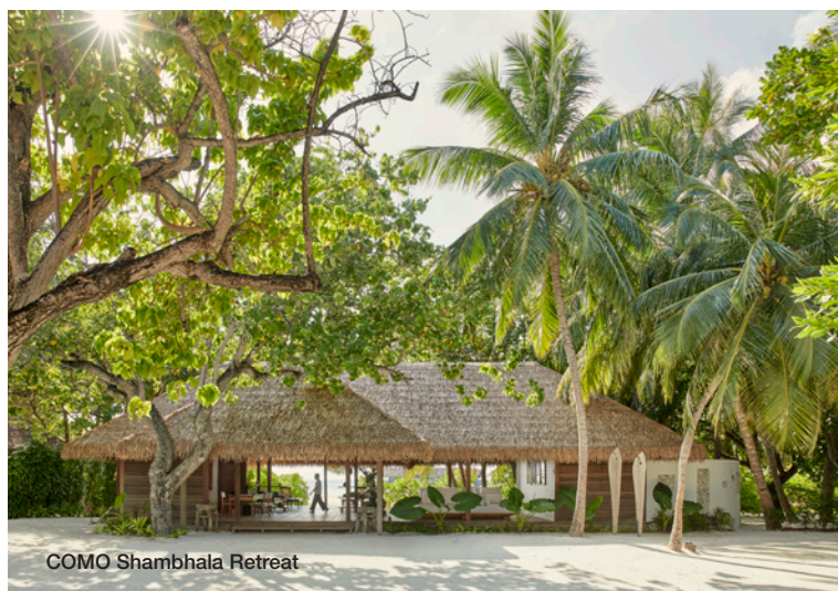
COMO Shambhala Retreat