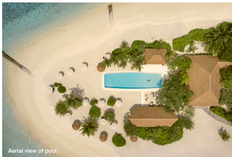
Aerial view of pool